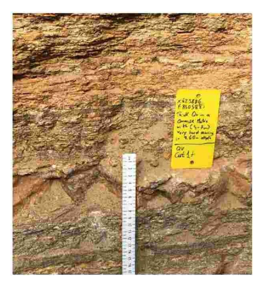
Mineralised quartz in new area