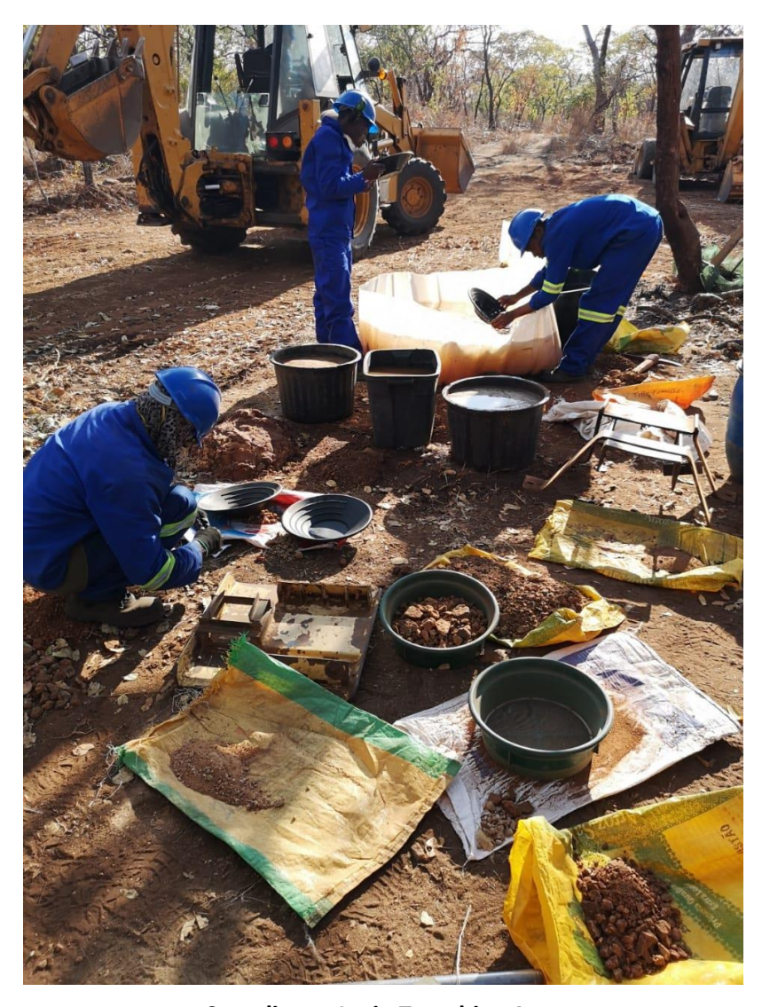
Sampling at Lurio Trenching Area